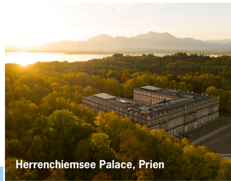
Herrenchiemsee Palace, Prien