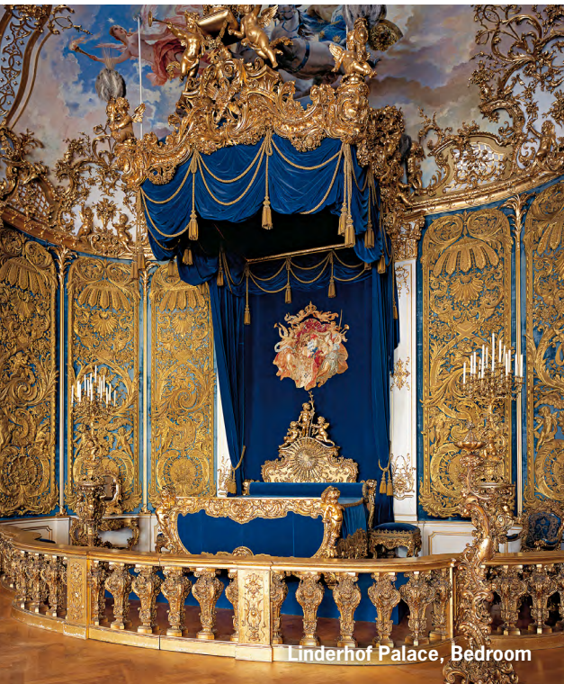
Linderhof Palace, Bedroom