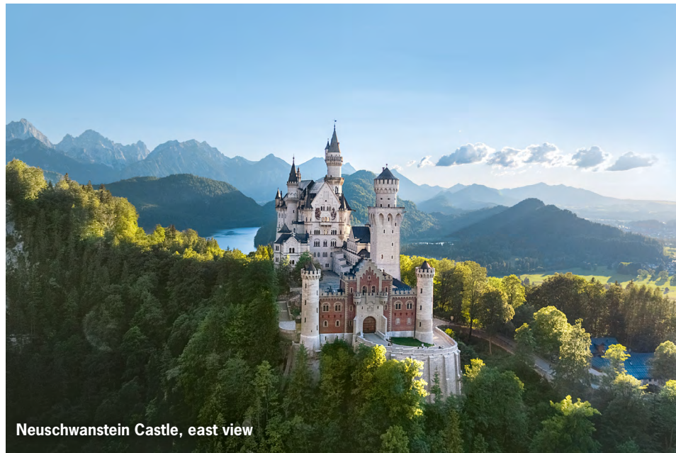
Neuschwanstein Castle, east view