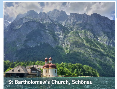
St Bartholomew's Church, Schönau