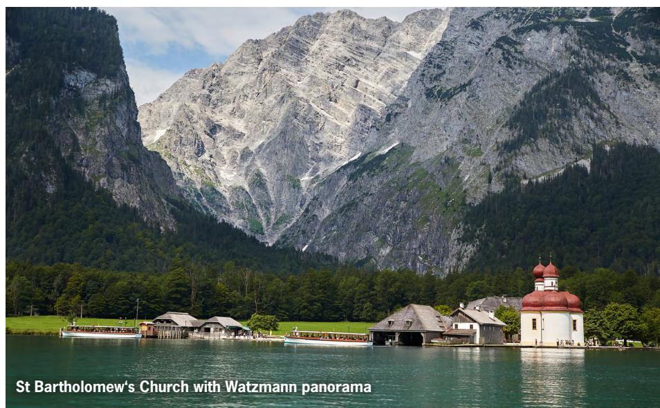
St Bartholomew's Church with Watzmann panorama