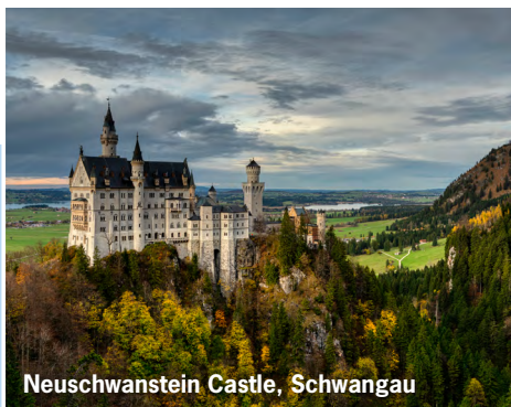
Neuschwanstein Castle, Schwangau

Schwangau → Linderhof → Herrenchiemsee → Schönau on Lake Königssee