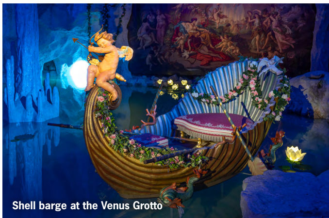
Shell barge at the Venus Grotto