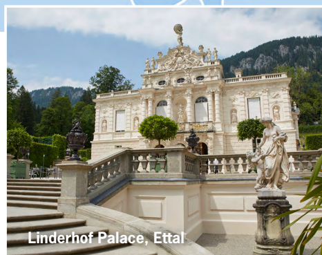
Linderhof Palace, Ettal