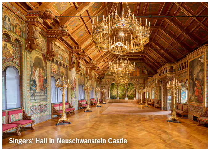
Singers' Hall in Neuschwanstein Castle