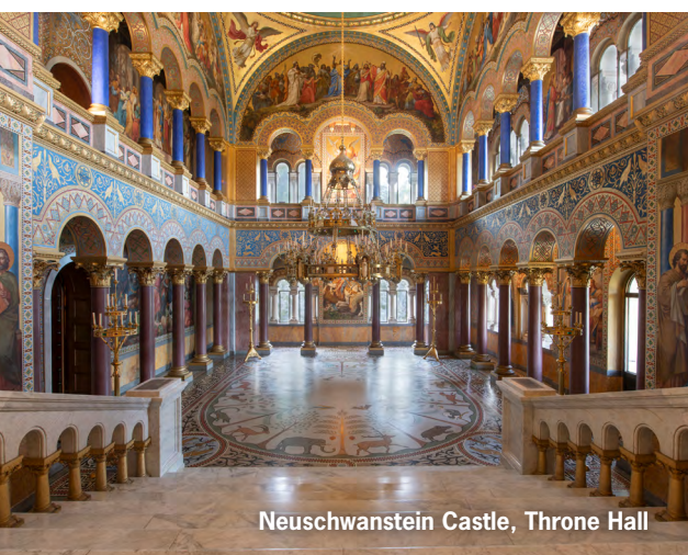
Neuschwanstein Castle, Throne Hall