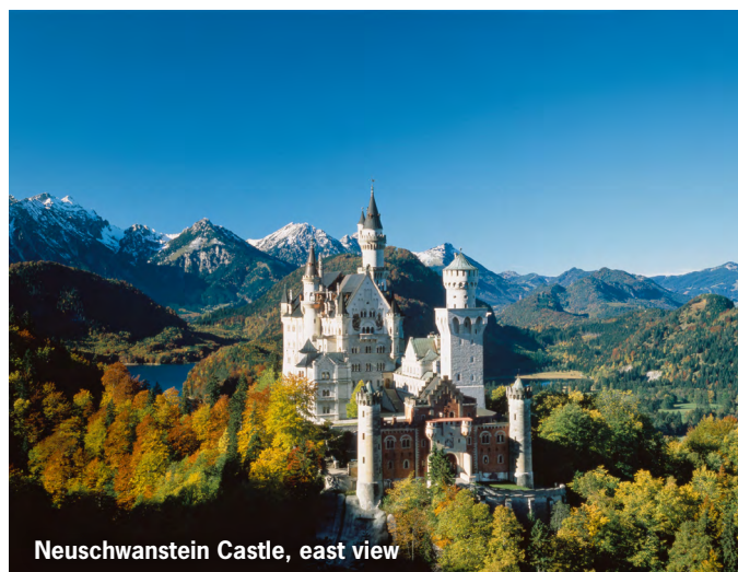
Neuschwanstein Castle, east view

Designed and furnished in the medieval style and equipped with the latest technology of the time, it is one of the most famous buildings in the world and a major symbol of German idealism. It was modelled in particular on Wartburg Castle, but also on illustrations of castles in medieval books. The rooms are decorated with murals of Old Norse and chivalric legends which were powerfully interpreted by Richard Wagner in his music dramas. The Singers' Hall plays tribute to two halls in