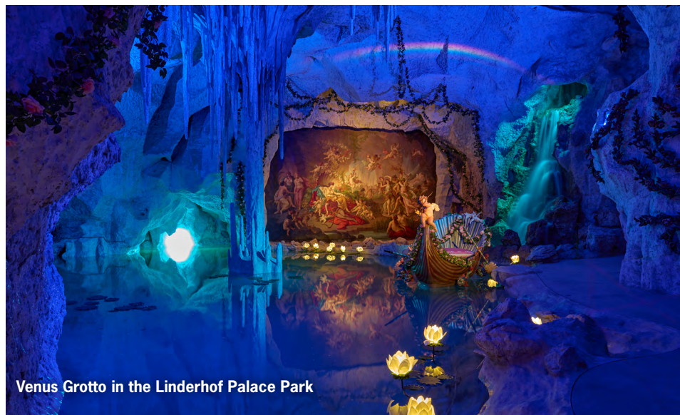
Venus Grotto in the Linderhof Palace Park