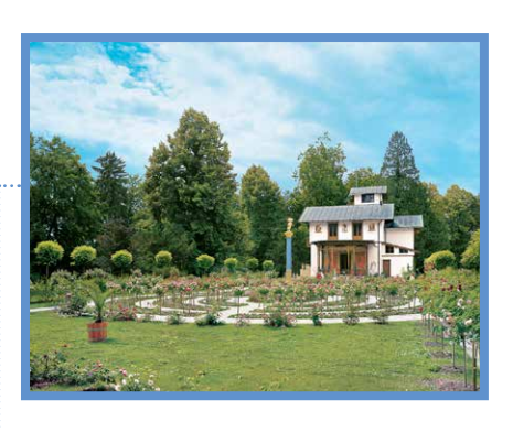
O3 Feldafing / Starnberger See Feldafing Park and Rose Island – Insider tip!