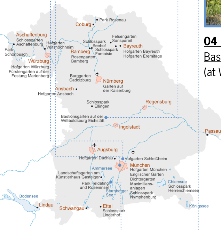
O4 EichstättBastion Garden(at Willibaldsburg Castle)