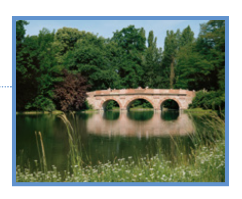
O3 Aschaffenburg Schönbusch Palace and Park