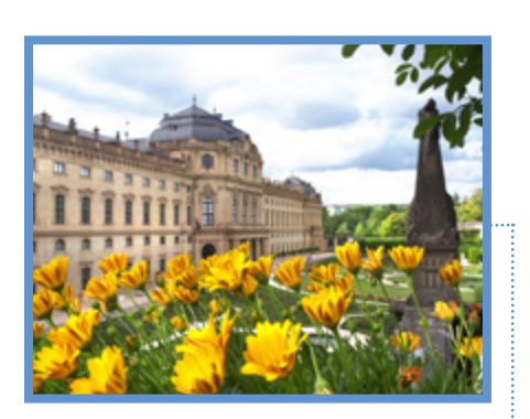
O1 Würzburg <a href="Residence and Court Garden">Residence and</a> Court Garden