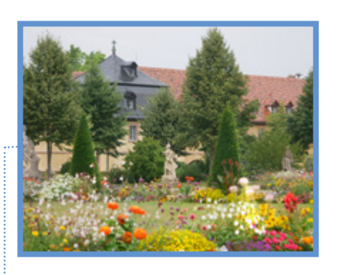
O2 Veitshöchheim Palace and Court Garden