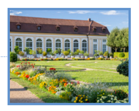
O4 Ansbach Residence and Court Garden – Insider tip!