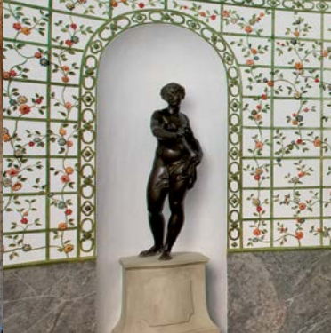
Palm Room, 1758 (l.); Garden Hall of the Italian Palace (r.)