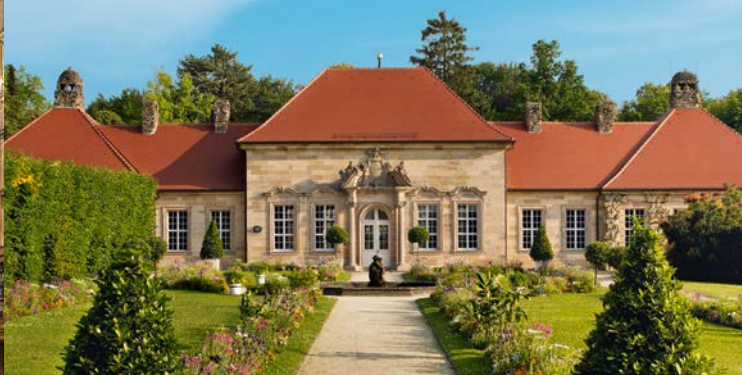
View of the Old Hermitage Palace with the fountain