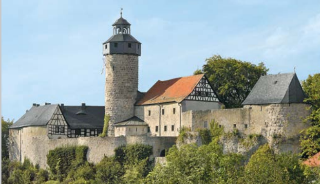
Zwernitz Castle; Title picture: New Hermitage Palace