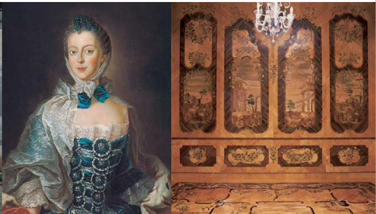
Duchess Elisabeth Friederike Sophie (l.); Spindler Cabinet (r.)

From 1793 Friederike Dorothee Sophie of Württemberg extended the gardens in the sentimental landscape style and added a catacomb and the pillar of harmony. From 1839 to 1881 Duke Alexander von Württemberg rebuilt the palace and extended the park to give it its present form, with landscape sections, sculptures, fountains and terraces. Since 2000 Fantaisie Palace has been the location of the first gardenmuseum in Germany. With numerous valuable exhibits it illustrates the history of garden design from the 17th to the 19th century. The museum tour includes the White Hall and the reconstructed Spindler Cabinet with its elaborate marquetry. The attractive palace park has original design elements from the three relevant phases of development in the Rococo, the sentimental landscape and the mixed styles, and is as important a historic record as the palace itself. A visit to the Fantaisie garden museum is not complete without a walk through the park with its numerous buildings and monuments.