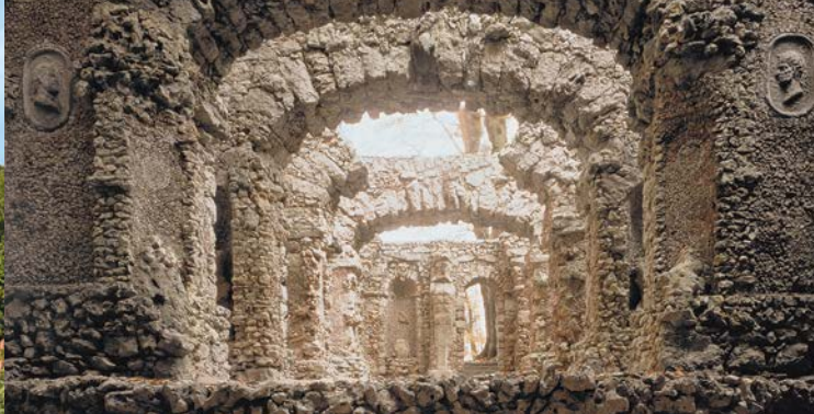
Sanspareil Rock Garden: stage of the ruined 'Roman' theatre