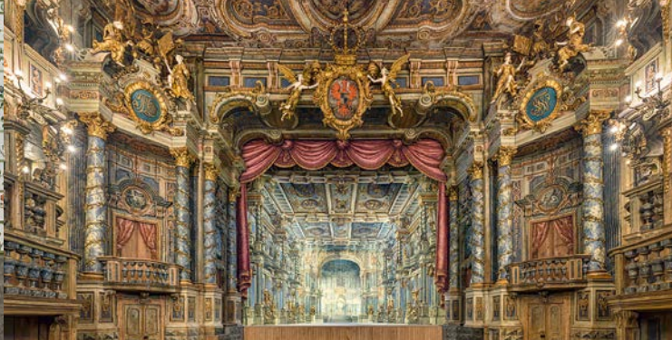
The stage with the reconstructed stage set