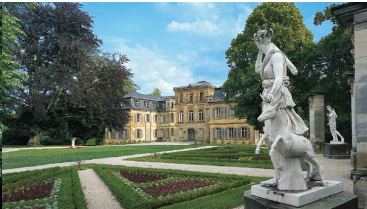
Fantaisie Palace with sculptures from the mixed style epoch

subject to decay. All these park buildings were probably the inspiration of the highly educated and artistic Margravine Wilhelmine.