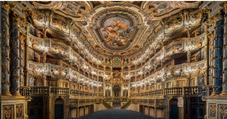
Interior of the opera house, looking towards the stage portal

The opera house inaugurated in 1748 is one of the most impressive examples of Baroque architecture built to celebrate a special occasion. It was modelled on the greatest opera houses of the time in Vienna and Dresden. Its interior with tiers of loges made entirely of wood was designed by Giuseppe Galli Bibiena, the most important theatre architect of his day. The driving force behind this project was Margravine Wilhelmine, a sister of Frederick the Great, who was herself an author, composer and the director of the court opera. The occasion for which the theatre was built was the wedding of the Bayreuth princess Elisabeth Friederike Sophie and Duke Carl Eugen of Württemberg in September 1748. The interactive exhibition brings to life the world of the Baroque theatre. There are numerous hands-on options such a stage with reconstructed Baroque machinery that visitors can try operating themselves. The exhibition has been designed to be accessible to everyone and is based on the multi-sense principle.