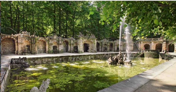
The Lower Grotto is located at the lowest point in the garden

INFORMATION Schloss- und Gartenverwaltung Bayreuth-Eremitage Ludwigstr. 21 · 95444 Bayreuth · Tel. +49 921 75969-0 sgvbayreuth@bsv.bayern.de · www.bayreuth-wilhelmine.de