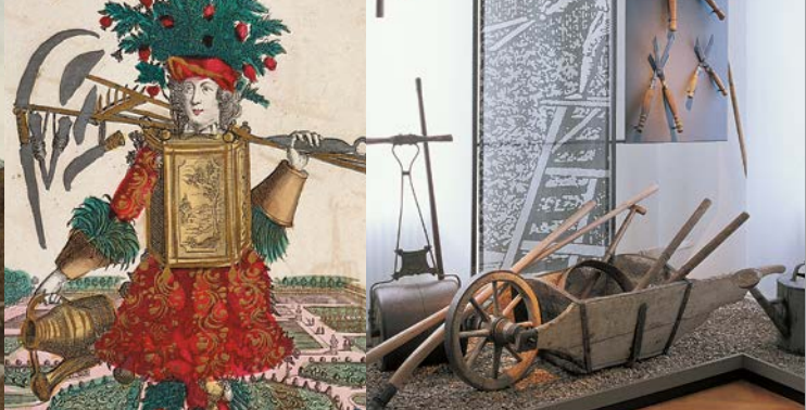
Copper engraving and garden tools from the museum