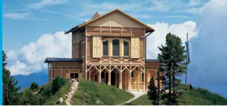
Construction of the King's House on Schachen started in 1870

Bavarian Minister of State of Finance, Regional Development and Regional Identity