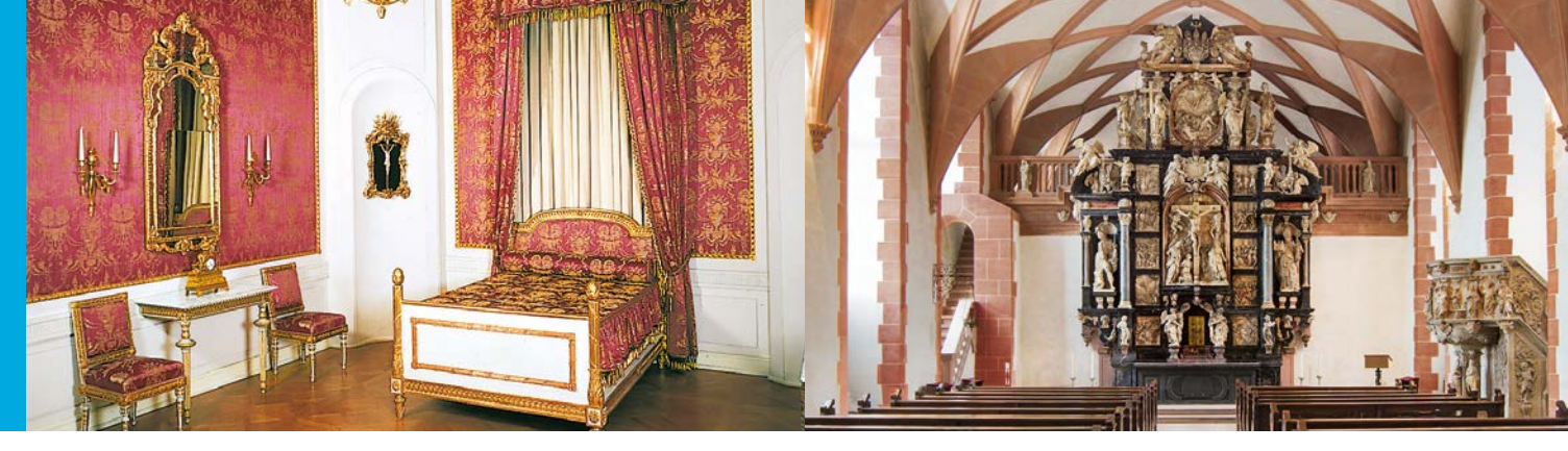
Bedroom in the Princely Apartments

Bayerischer Staatsminister der Finanzen und für Heimat