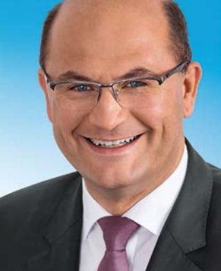
I wish vou a fascinating visit to Aschaffenburg!