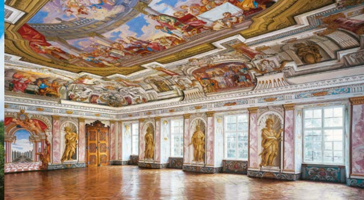
Baroque Emperor hall in Augustine Monastery