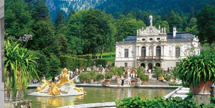
Main façade of Linderhof Palace