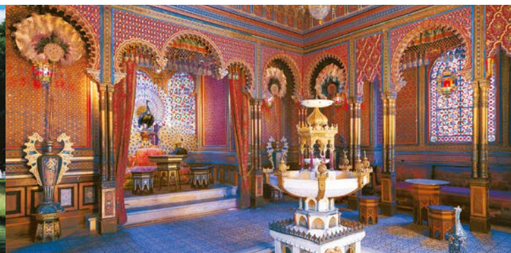
The Moorish Kiosk in Linderhof

19th century, combines motifs from Baroque garden design with magnificent water parterres and an English landscape garden. In the grounds are fascinating buildings such as the Moroccan House, the Moorish Kiosk and the Venus Grotto, a huge artificial grotto based on Richard Wagner's description of the set for Act I of his opera Tannhäuser. Two further stage sets from Wagner's music dramas are Hunding's Hut (Act I of Die Walküre) and the Hermitage of Gurnemanz (Act III of Parsifal). Linderhof was Ludwig II's favorite residence.