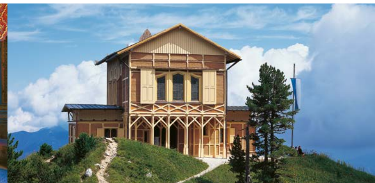
King's House on Schachen

This small palace built for Ludwig II is magnificently located at an altitude of over 1800 m against the backdrop of the Wetterstein massif in the Alps. The wooden building has a rather modest exterior and simple rooms on the ground floor, but the hall occupying the first floor is furnished with oriental splendour. The king sought the seclusion of the mountains to celebrate his birthday and his name day in the lavishly decorated Turkish Hall furnished with divans and a fountain. The King's House can only be reached on foot, either from Elmau, Garmisch-Partenkirchen or Mittenwald.