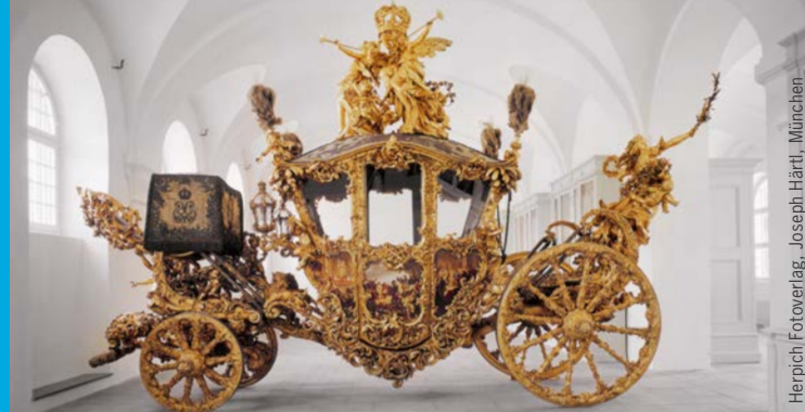
The new dress coach of King Ludwig II in the Marstallmuseum

Bavarian Minister of State of Finance and Regional Identity