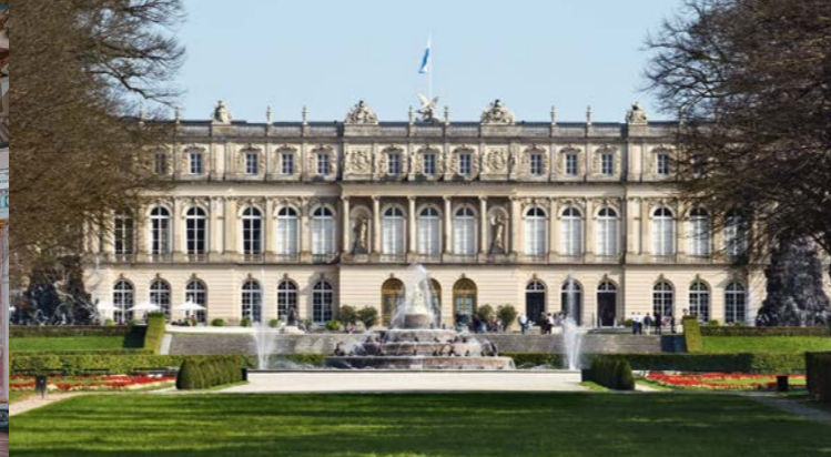
Herrenchiemsee Palace (New Palace)