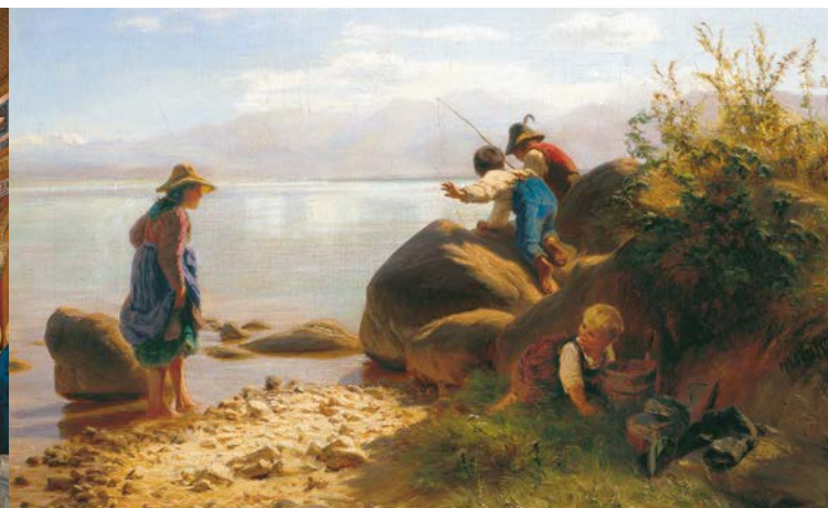
'Children Fishing on the Chiemsee', F. W. Pfeiffer (1822–1891)

The Baroque splendour of the former monastery has been preserved in the Library Hall, Imperial Hall and Garden Room. When King Ludwig II acquired the Herreninsel in 1873, he had living quarters created according to his own specifications in the monastery building. This was where he stayed when he was inspecting the work on the New Palace. The former monastery became the so-called Old Palace where the Constitution Convention was held in 1948 to draw up the constitution of the Federal Republic of Germany. Also in the Old Palace are two galleries showing the works of Chiemsee artists and of Julius Exter.