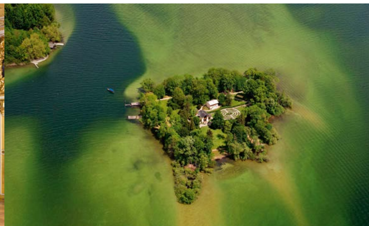
The Rose Island and the shallows around it

Ludwig II loved this small island with the Pompeian Casino built by his father. When he was young he invited special guests here such as the Russian Czarina Maria Alexandrovna. Sometimes Empress Elisabeth of Austria, with whom he had a great deal in common, also came to the island. The rose garden has been reconstructed with many fragrant old varieties of rose. The Casino with its fine, comprehensively restored interior is open to the public and a small exhibition documenting the surprisingly long history of the island is on display in the gardeners' house. The remains of prehistoric pile dwellings on the bottom of Lake Starnberg by Rose Island have been included on UNESCO's World Cultural Heritage list. From here the Votive Chapel on the east shore of the lake can be seen. It was built high above the place where Ludwig II died on 13 June 1886, not far from a further royal property, Berg Palace.