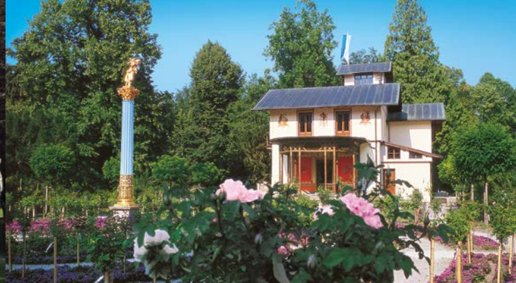
The rose garden on the east side of the Casino