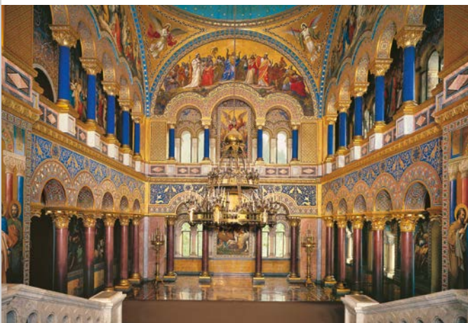
Throne Hall in Neuschwanstein Castle

The interior features picture cycles from old Norse and chivalric legends. The Singers' Hall is based on two halls in the Wartburg, and the Throne Hall, which celebrates power and authority, was inspired by Byzantine and early Christian churches.