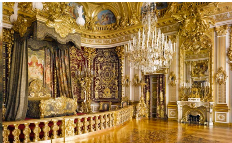
The State Bedchamber in Herrenchiemsee Palace

This monument to Absolutism which is far more magnificently furnished than the palace of Versailles on which it was modelled, was begun in 1878. The State Bedchamber in the Large Apartment is the most expensive room of the 19th century. The porcelain in the Small Apartment is the largest single order ever received by the Meissen manufactory and the richness of the embroidery on the textiles is beyond comparison. In this palace Ludwig II conjured up kingship with all the means at his disposal. The building remained incomplete, as did also the park around it, which was modelled on Versailles with its splendid fountains and intended to cover most of the island; today the gardens are surrounded by a natural area with important biotopes. In the palace, the comprehensive Ludwig II Museum documents the life and work of the man described by Paul Verlaine in 1886 as the 'only true king of the 19th century'.